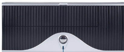
Power button with LED